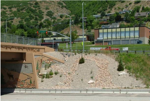
4500 South Overpass

Dominion is responsible for the following: