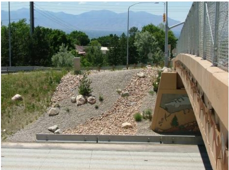
4500 South Overpass