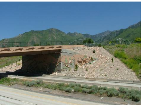
3300 South Overpass