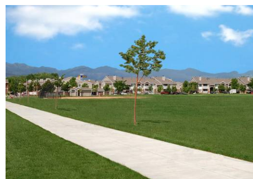
Baseball field and football fields