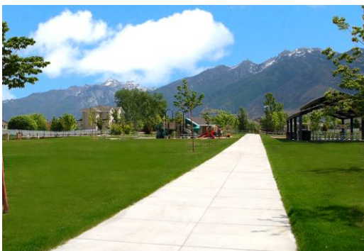
Picnic pavilion and playground