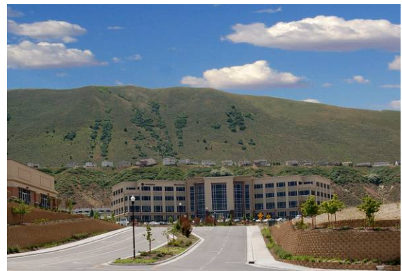
View looking up Corporate Drive