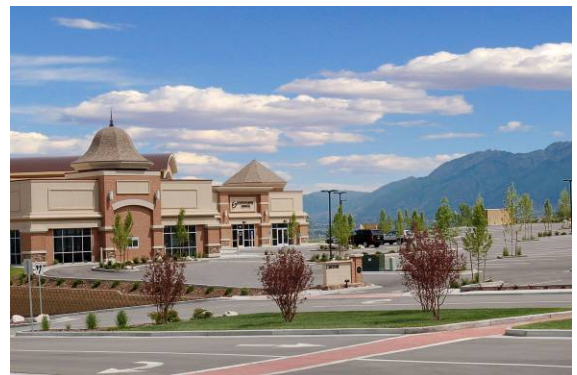
Commercial/Retail building pad