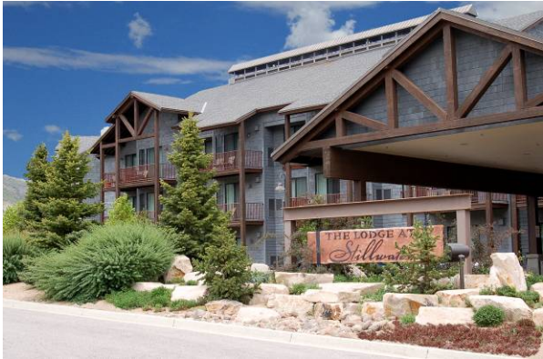
The Lodge at Stillwater