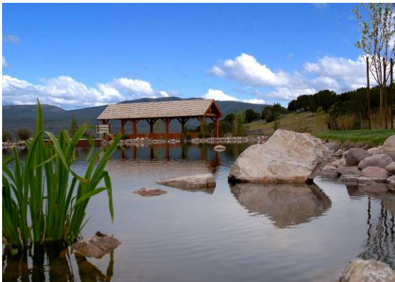
Fishing pond and adjacent recreational park

Dominion is responsible for the following: