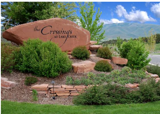
The Crossings at Lake Creek enhanced entrance sign