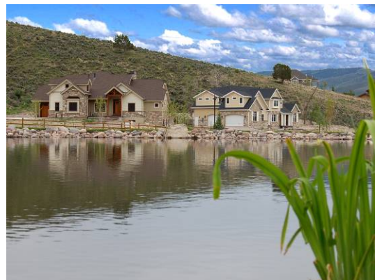
Building lots with views of the fish pond